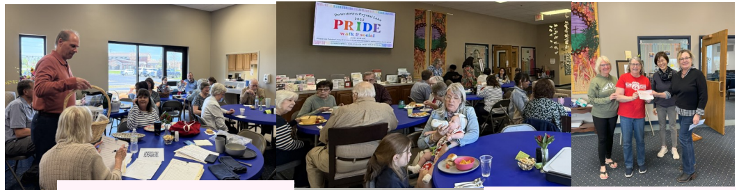
Mission Service Auction