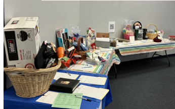
Volunteering at Northern IL Food Bank Neighborhood Market in Rockford